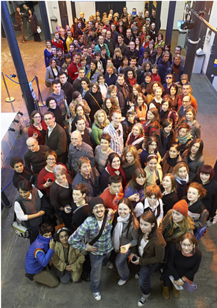
FrenchMattershead, A Daily Ritual to Capture the Presence of Everybody, Thursday 9 February 2006, photograph from performance for camera, National Review of Live Art, Glasgow