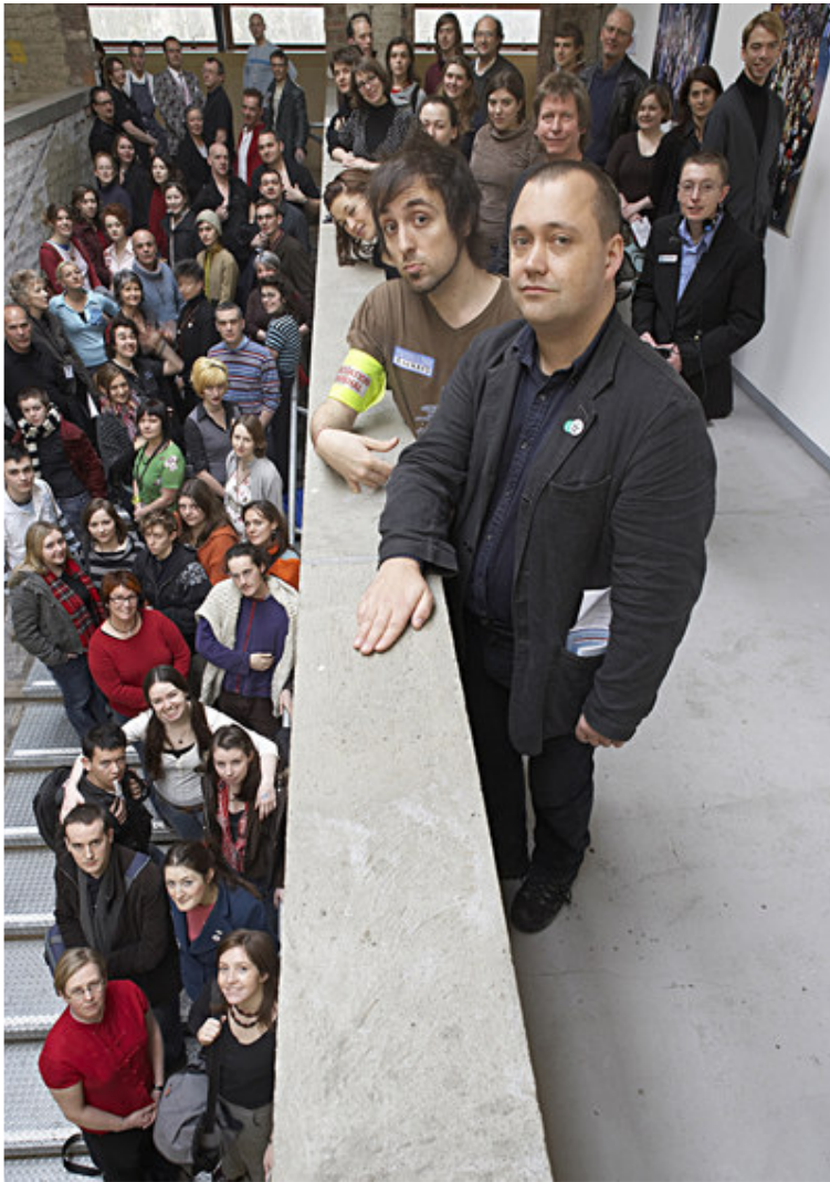
FrenchMattershead, A Daily Ritual to Capture the Presence of Everybody, Sunday 12 February 2006, photograph from performance for camera, National Review of Live Art, Glasgow