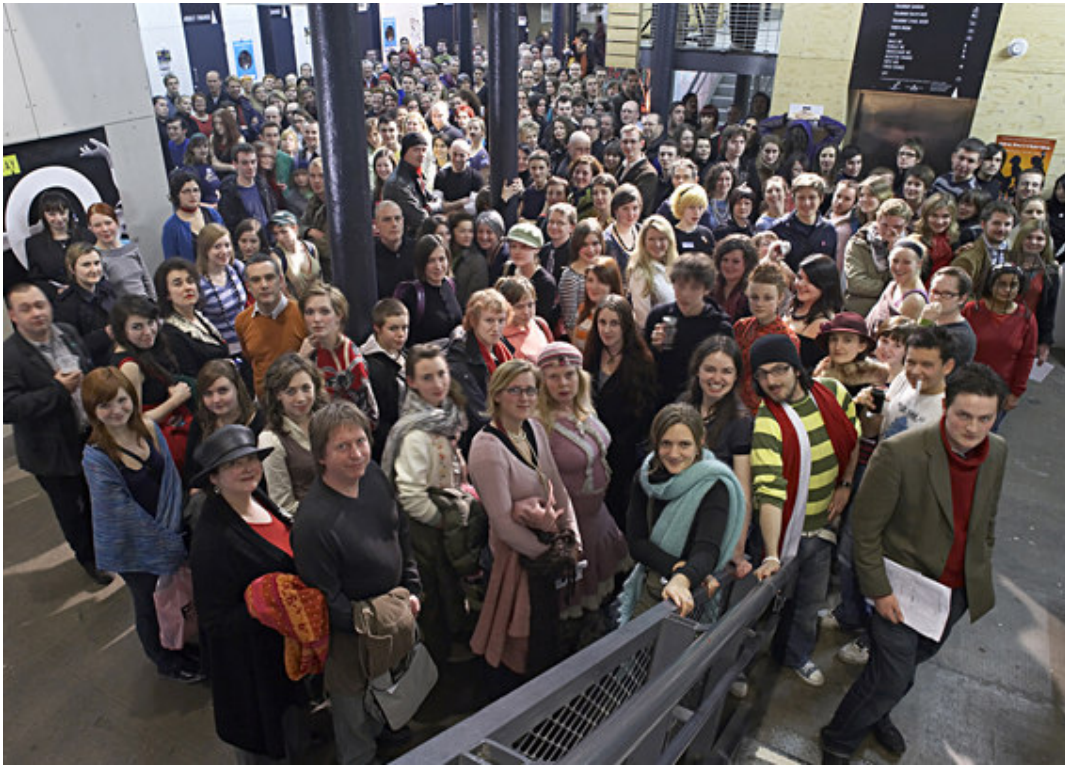
FrenchMottershead, A Daily Ritual to Capture the Presence of Everybody, Saturday 11 February 2006, photograph from performance for camera, National Review of Live Art, Glasgow (courtesy of the artists; photo: Neilson Photography)